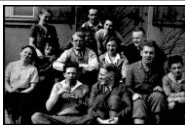
Bonhoeffer with students