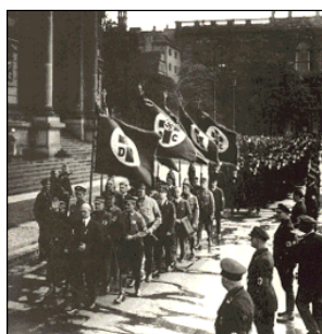
Bonhoeffer opposed the state church that placed the swastika in the middle of the cross