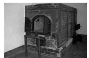
Crematorium at Flossenbuerg where Bonhoeffer's body was cremated after hanging